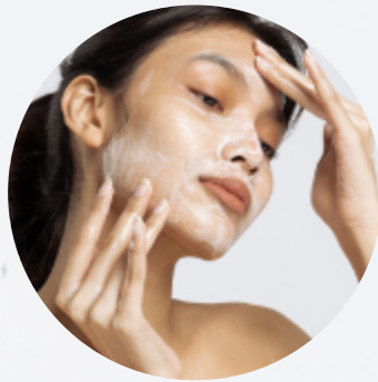
Cleansing products: micellar water, scrub etc.